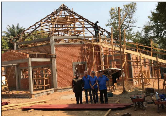
Bible House under construction.

The financial picture of the Bible House project is proving to be a challenge as the cost of materials and labour have gone considerably over contract due to several factors.