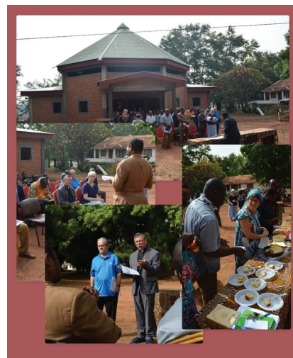
Photos from the service of blessing in April.