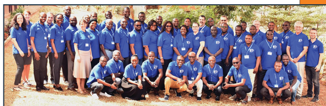
iDelta class of 2023